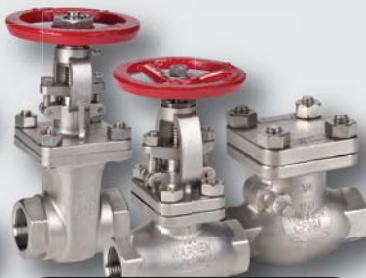
#1156-T, 2156-T, 3156-T