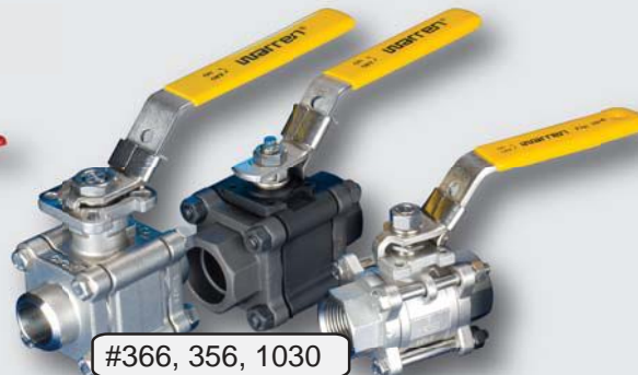
#366, 356, 1030