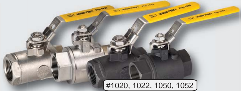
#1020, 1022, 1050, 1052