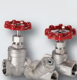
#221, 222, 223