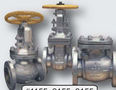
#1155, 2155, 3155